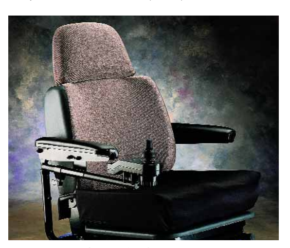
Low Back Captain Seat with Solid Seat Base